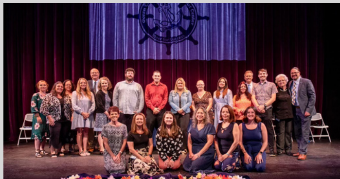
Ocean County Achievement Center Staff & Partners, Graduation