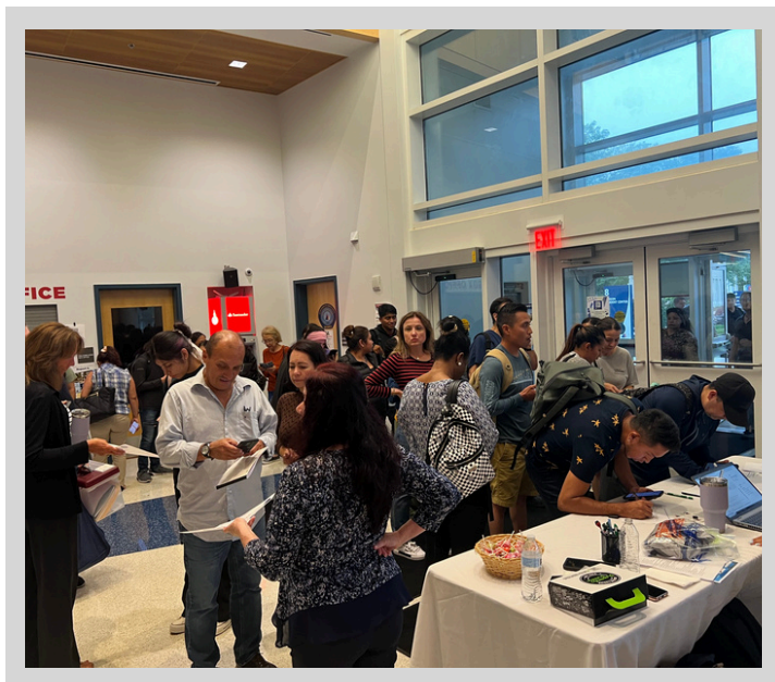
OCAC & Waters and Sims Job Fair