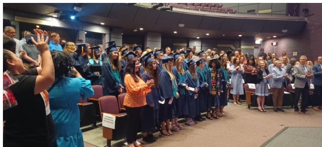
Ocean County Achievement Center Graduation, Grunin Center, Ocean County College