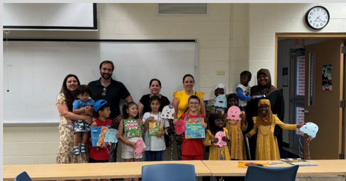
Family Literacy Event, Ocean County Library