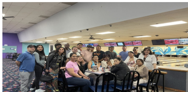
English as a Second Language Class Bowling Trip